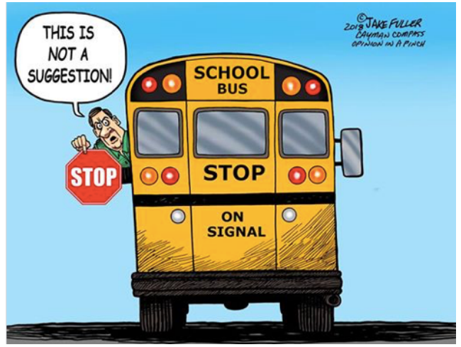
Remember, it is easier to explain to your boss why you are late to work than to explain to a parent why their child will not be coming home tonight.

I hope everyone enjoys the last few weeks of summer and I wish everyone a great fall. Happy Halloween and Thanksgiving!!!